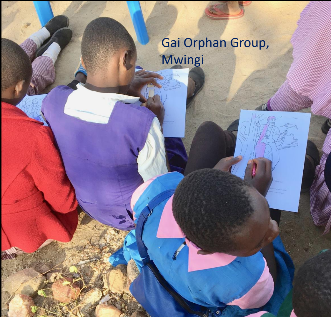
Gai Orphan Group, Mwingi

*Helped them memorize Isaiah 43:1, “Do not fear for I have redeemed you; I have called you by name; you are mine.”