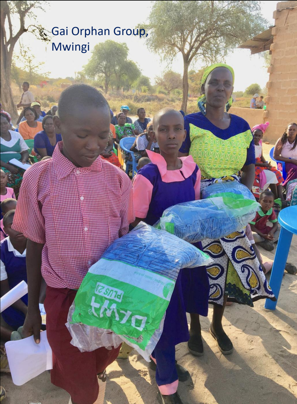
Gai Orphan Group, Mwingi

* Distributed 200 mosquito nets to foster children and their guardians to prevent recurring malaria