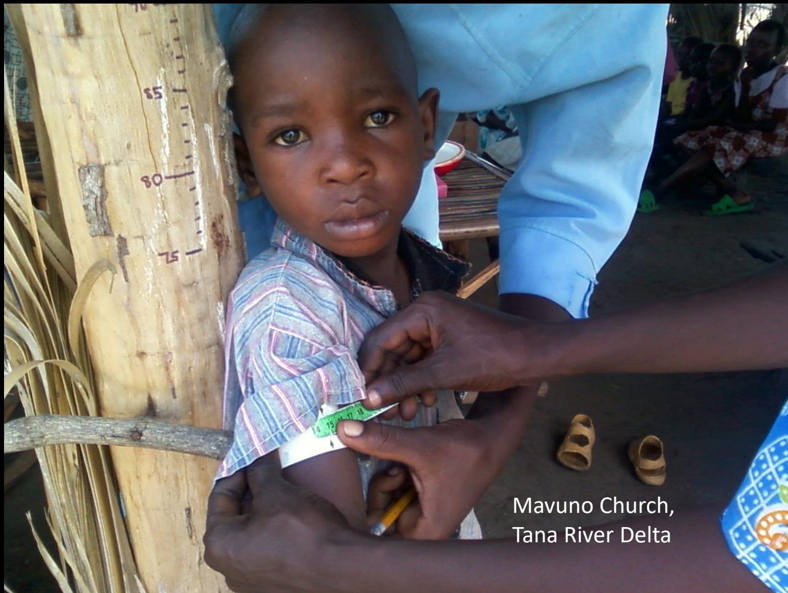
Mavuno Church, Tana River Delta

In the area of preventative care, we keep records on their growth,