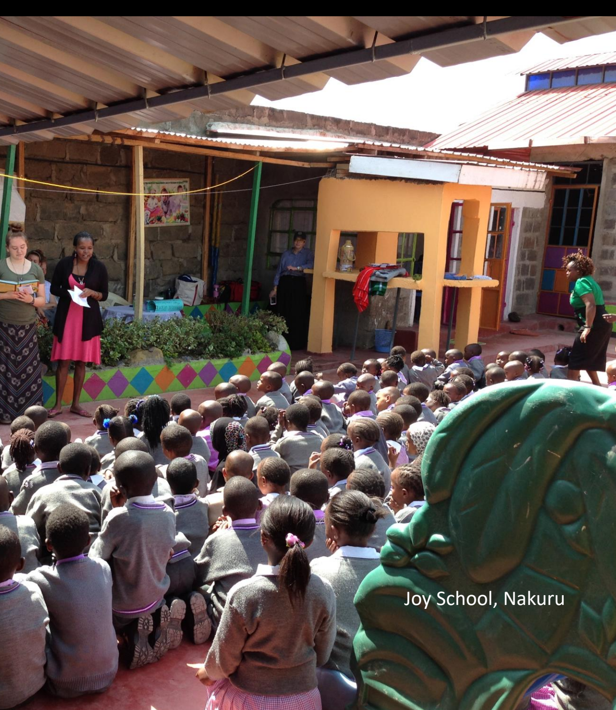
Joy School, Nakuru

...and city slums to serve children and their families with healthcare.