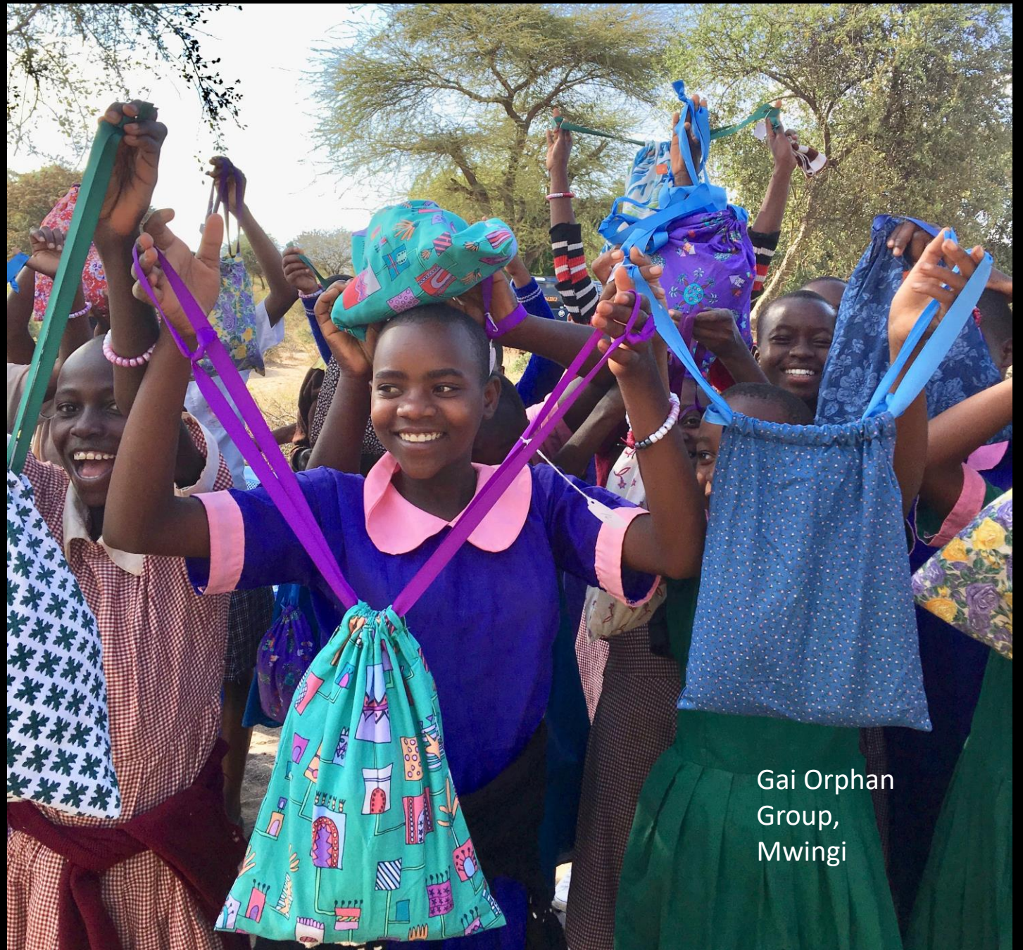
Gai Orphan Group, Mwingi

*Gifted pre-teen girls with hygiene kits with reusable feminine products, cycle tracker bracelets and health education so they can attend school every day of the month