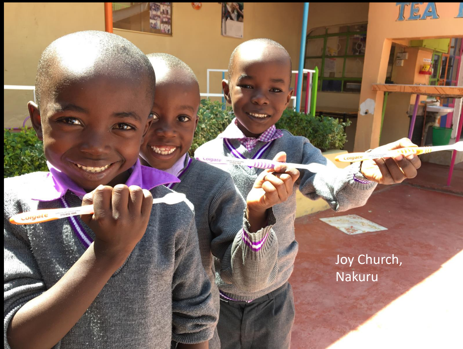
Joy Church, Nakuru